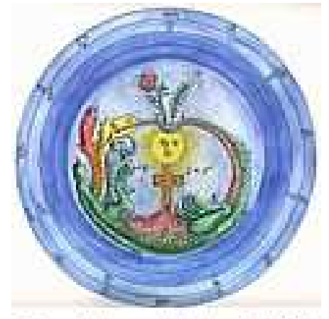
From Mason Manly P. Hall

Masonry and of "in god we trust" are not the God of the Bible, but fallen spirits of deception and destruction. Where they rule they bring death. Lucent leases an office in NYC; the address? 666 Fifth Avenue. Lucent has developed many