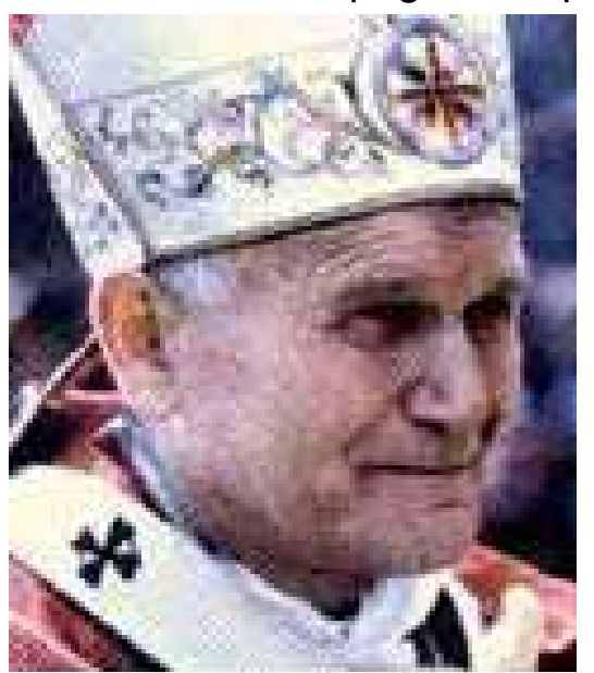
No secrets here! ancient sunwheel on lapel, sun god Annu on mitre. Obviously, this man serves sun god Lucifer.

The sun wheel, and cross, is of course, as old as man, who has for 6,000 years worshipped the sun. The cross is the sign of the Prince who rules this world, having its origin with Nimrod of Babylon, "Tammuz." The Jews, after God severely judged them and destroyed their country because of despicable satanism and paganism, promptly adopted even more paganism from their